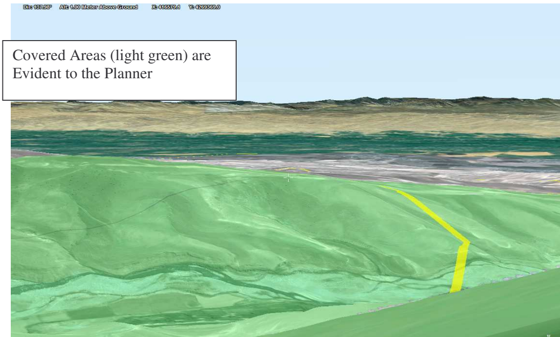
Figure Three - Coverage Area as Seen from Sensor's Point of View

Additionally being able to see what the sensor sees makes possible a wide range of dynamic mission planning and analysis of alternatives. Even on a field deployable notebook computer, SecurSoft is fast enough to support on the fly planning of reconnaissance patrol missions. SecurSoft can easily generate patrol route simulations or “mission movies” which have been found to be very useful to field personnel planning patrols. Mission movies simulate the field of view of the sensors along the patrol route and enable field commanders to transmit route changes in real time securely to patrol units. This gives a field commander a considerable degree of mission flexibility. As fully demonstrated by security planners, it is possible to improve a patrol's operational effectiveness by quickly assessing alternative vantage points and taking full advantage of short time frame opportunities to capture current field data.